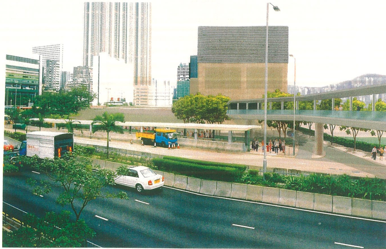
實施緩解措施十年後 - 佐敦道向九龍西站 YEAR 10 WITH MITIGATION - WKN STATION FROM JORDAN ROAD