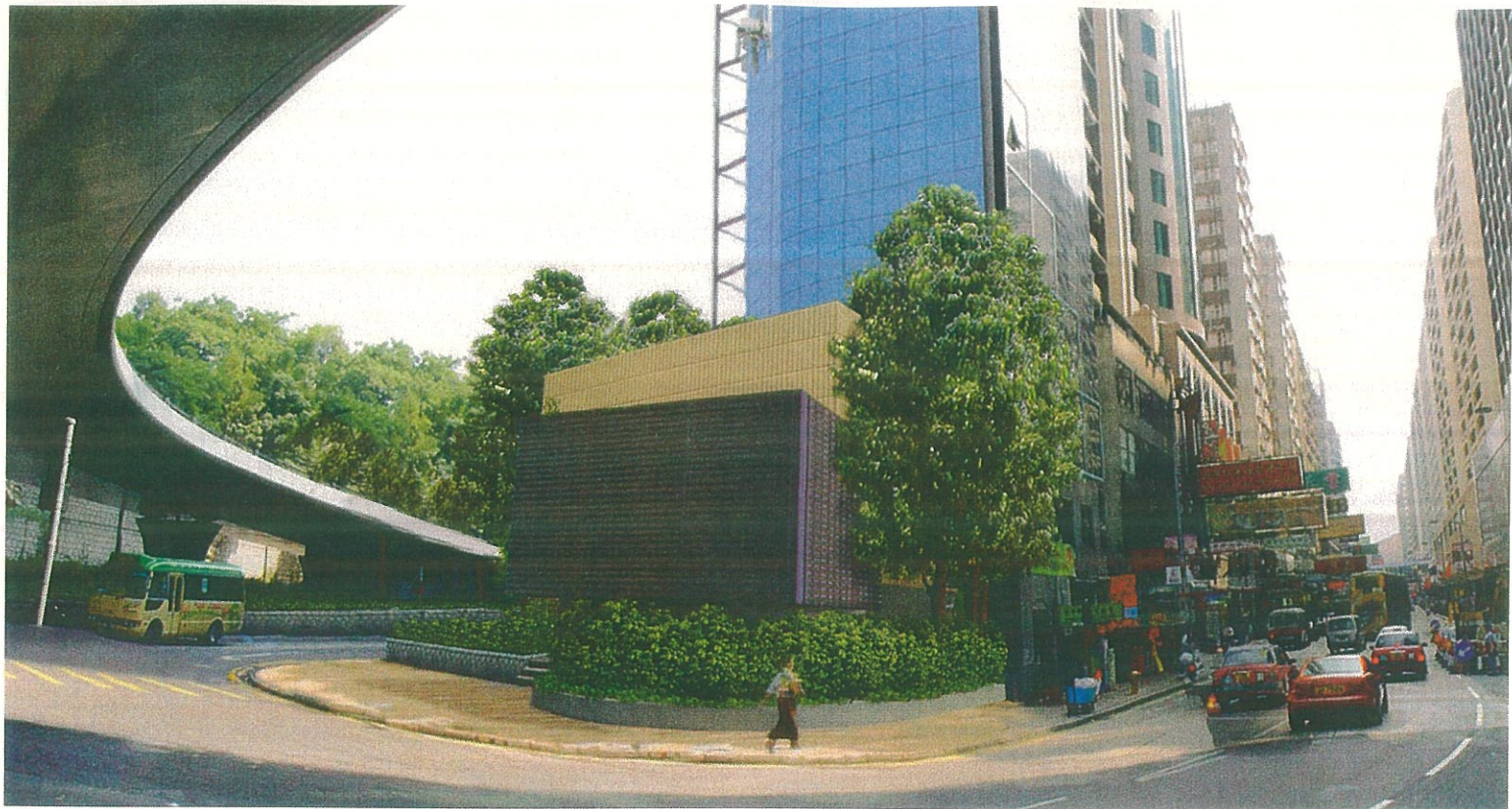
實施緩解措施十年後 - 廣東道機房大樓 YEAR 10 WITH MITIGATION - CANTON ROAD PLANT BUILDING