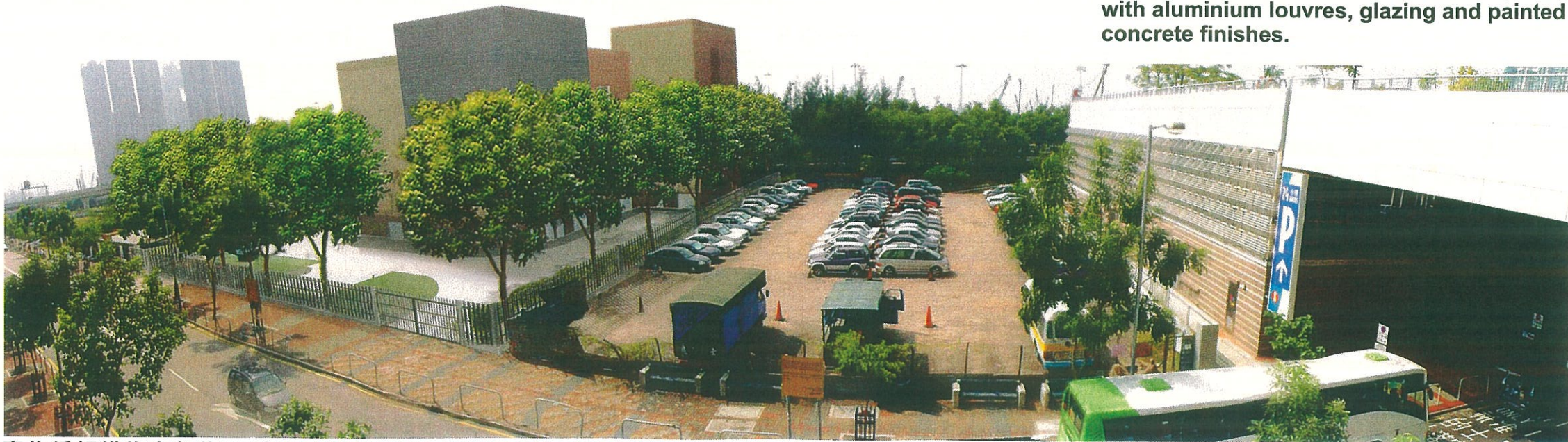
實施緩解措施十年後 - 油麻地通風大樓 YEAR 10 WITH MITIGATION - YAU MA TEI VENT BUILDING